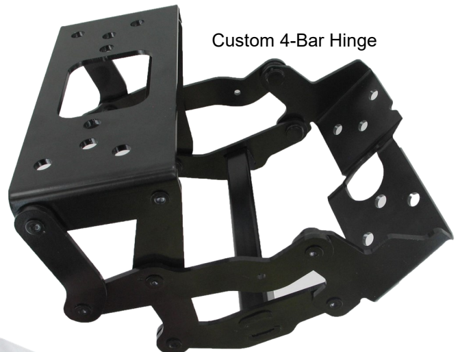
Custom 4-Bar Hinge