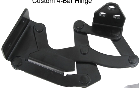
Custom 4-Bar Hinge