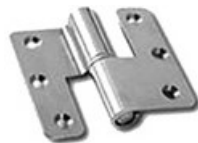
Barrel Style Hinge