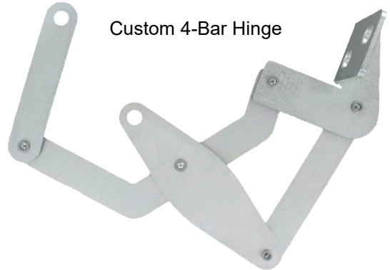
Custom 4-Bar Hinge